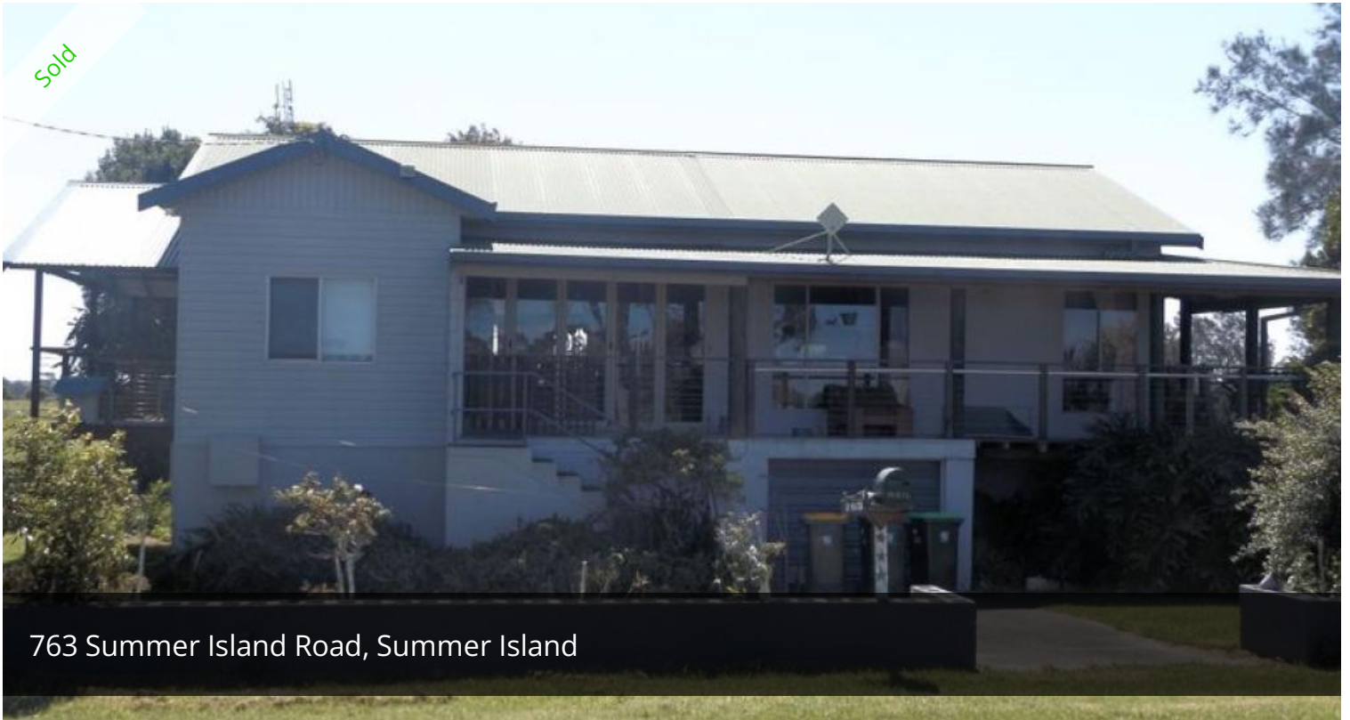
763 Summer Island Road, Summer Island