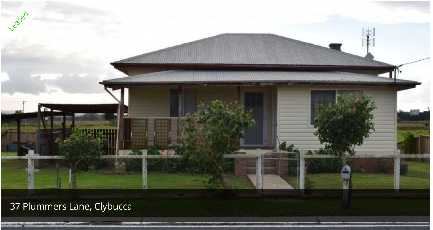
37 Plummers Lane, Clybucca