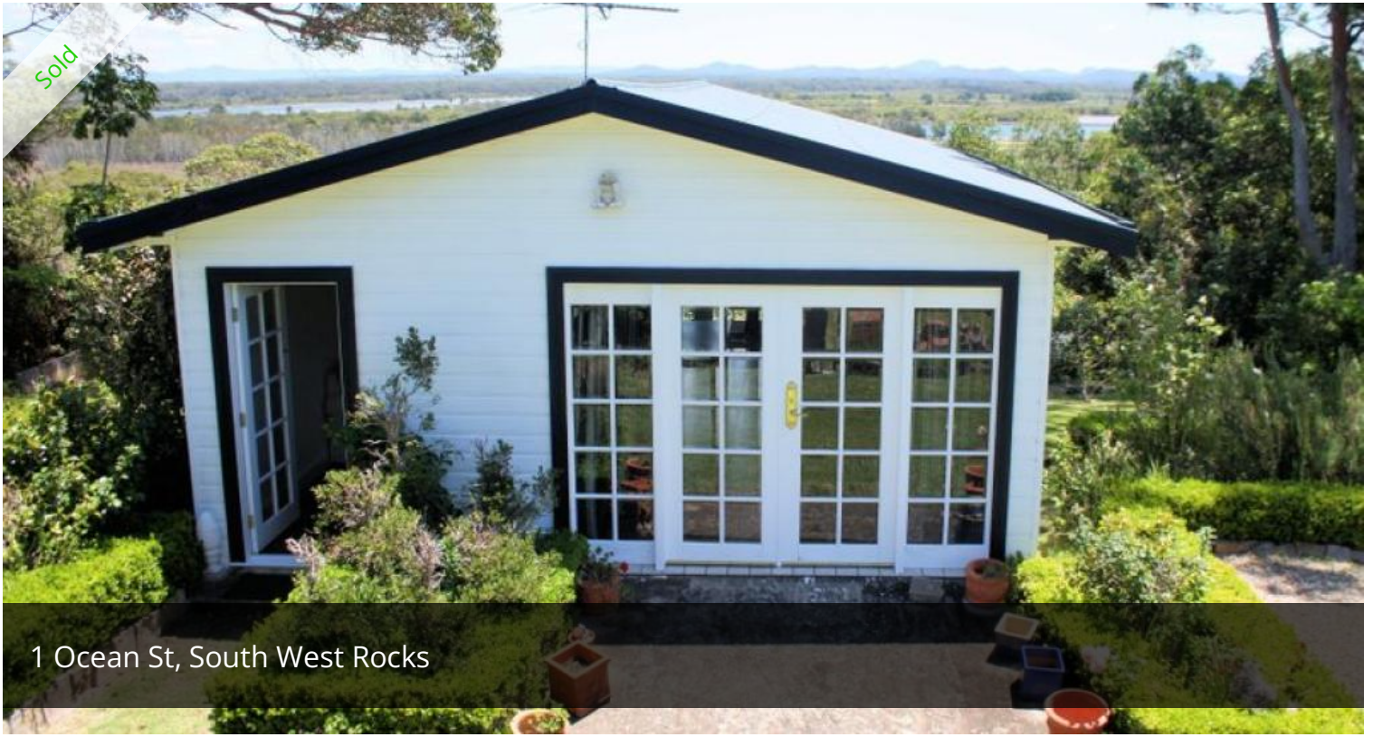
1 Ocean St, South West Rocks