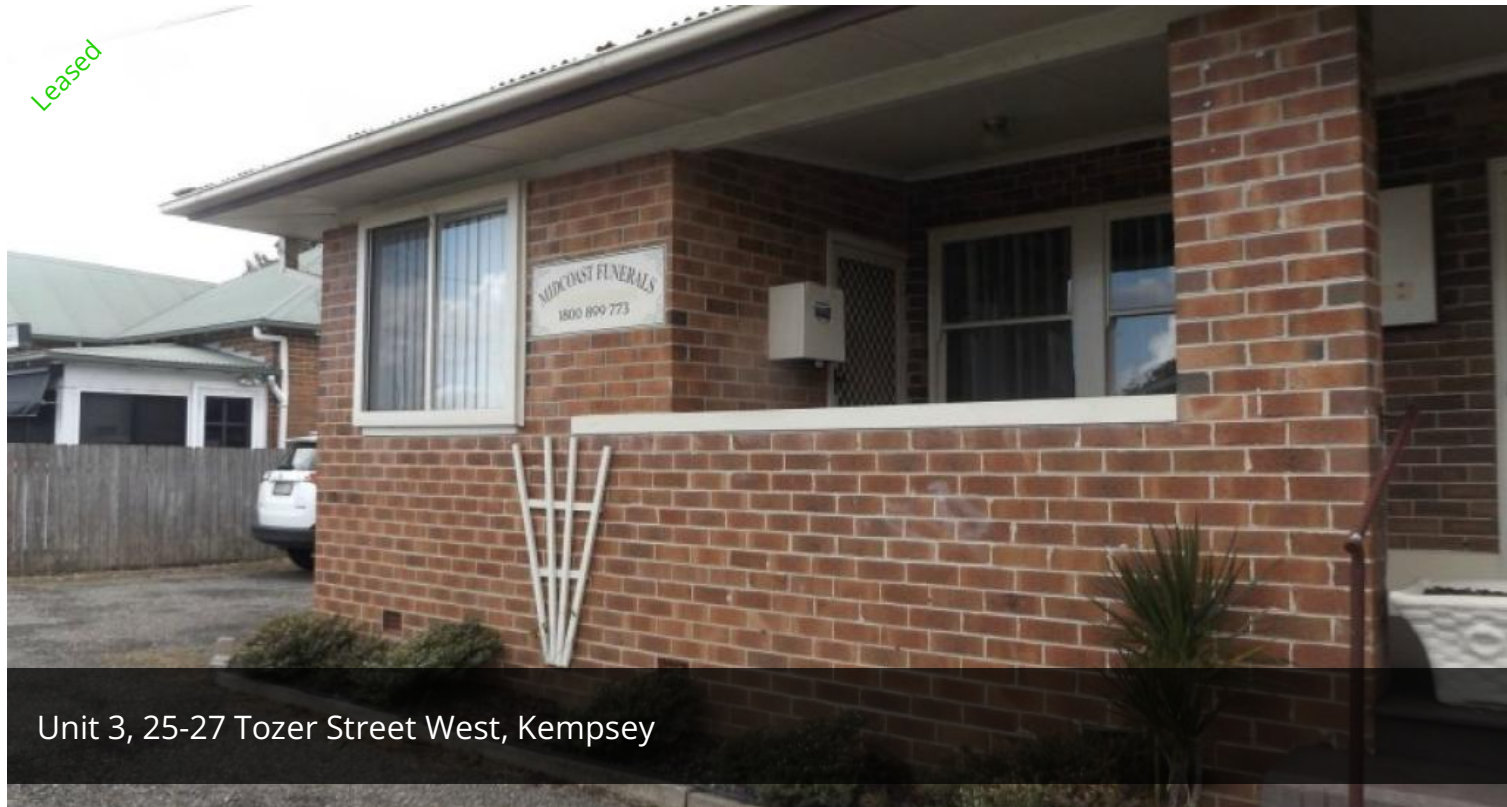
Unit 3, 25-27 Tozer Street West, Kempsey