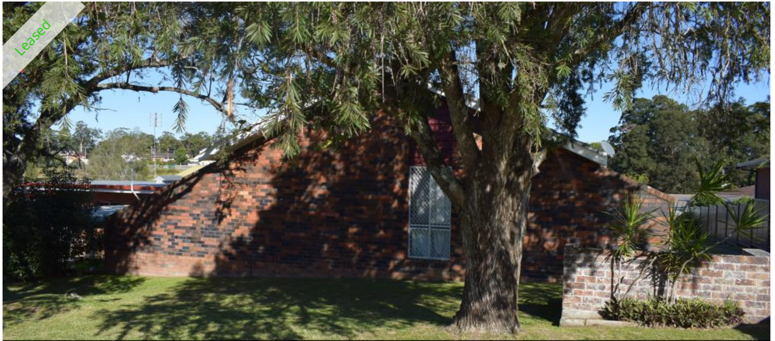
Unit 2, 156 Tozer St, West Kempsey