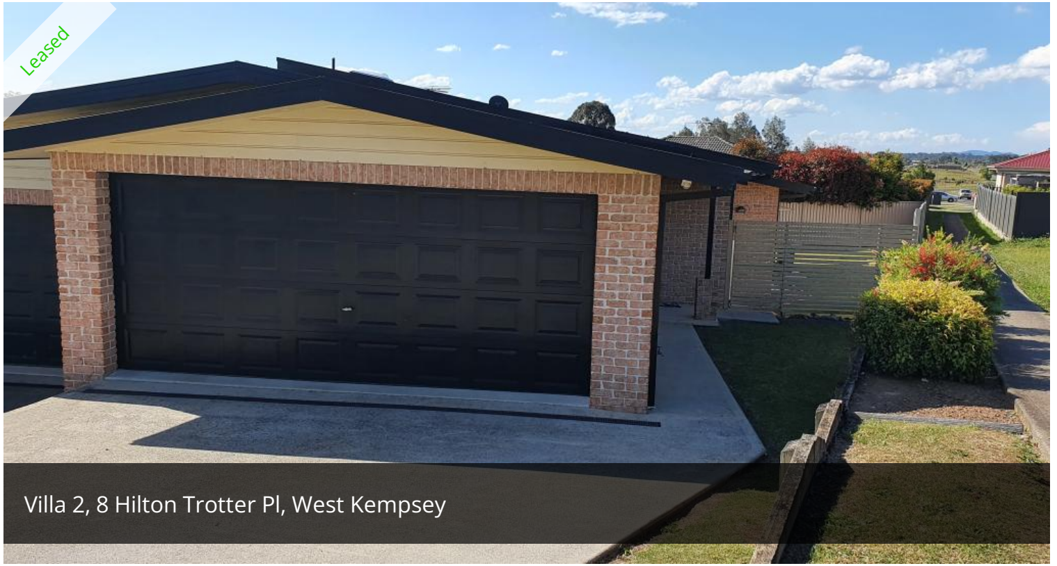
Villa 2, 8 Hilton Trotter Pl, West Kempsey