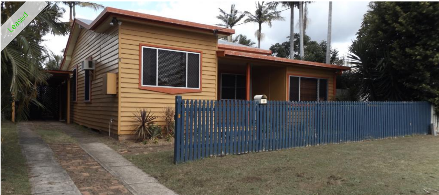
11 Betts Street, East Kempsey